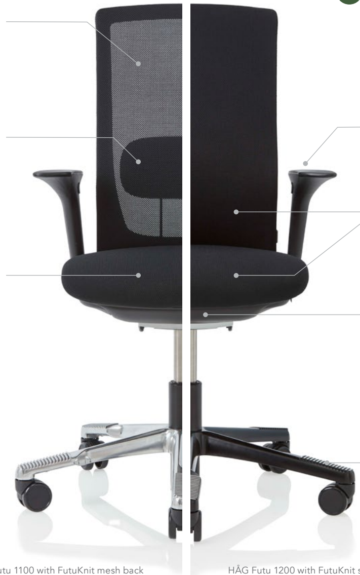
HÅG Futu 1100 with FutuKnit mesh back

7 appealing colours Select from seven matching fabrics and mesh colours – FutuKnit mesh (back) and FutuKnit solid (seat and back).