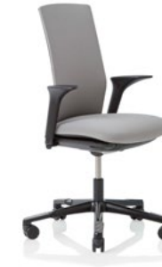
HÅG Futu 1200-S FutuKnit solid Stone – FTU101