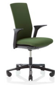
HÅG Futu 1200-S FutuKnit solid Forest – FTU104