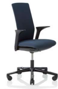
HÅG Futu 1200-S FutuKnit solid Dusk – FTU102