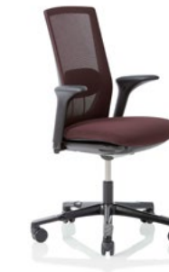
HÅG Futu 1100-S* FutuKnit mesh Aubergine – MEH103