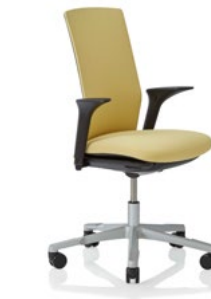
HÅG Futu 1200-S FutuKnit solid Straw – FTU105