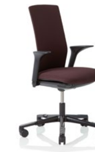
HÅG Futu 1200-S FutuKnit solid Aubergine – FTU103