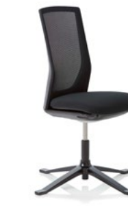
HÅG Futu Comm mesh 1102 FutuKnit mesh Night – MEH099