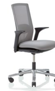
HÅG Futu 1100-S* FutuKnit mesh Stone – MEH101