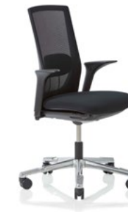
HÅG Futu 1100-S* FutuKnit mesh Night – MEH099