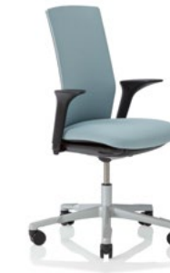
HÅG Futu 1200-S FutuKnit solid Frost – FTU100