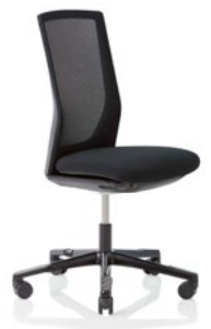
HÅG Futu Comm mesh 1102** FutuKnit mesh Night – MEH099