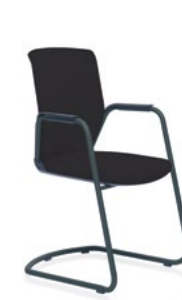
HÅG Futu Comm 1070 FutuKnit solid Night – FTU099