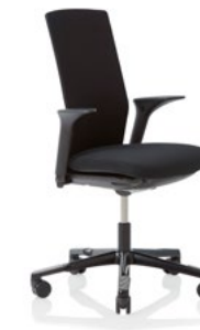
HÅG Futu 1200-S FutuKnit solid Night – FTU099