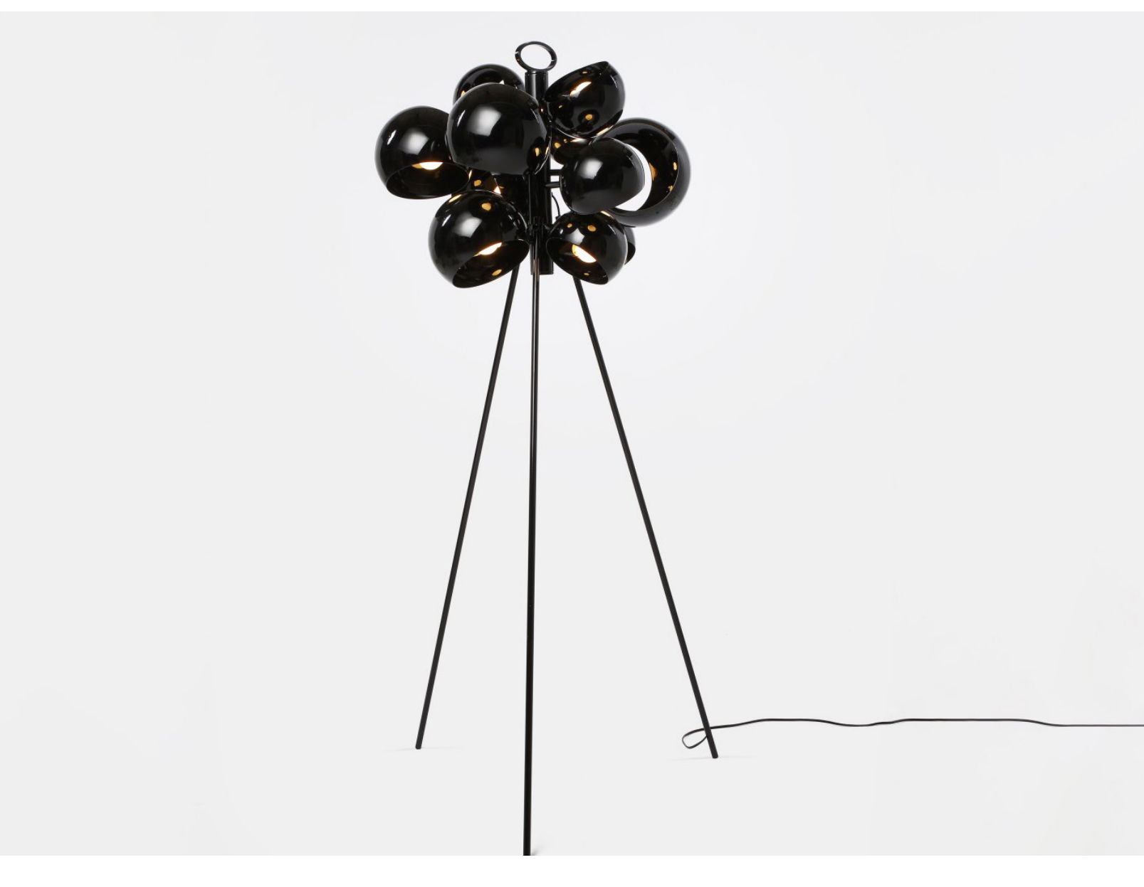
Classic. Modern. The Kopra Standing lamp from David Weeks Studio.