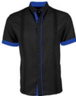
Couture Black Clásico Mandarin Presidencial Guayabera NO POCKET STYLE