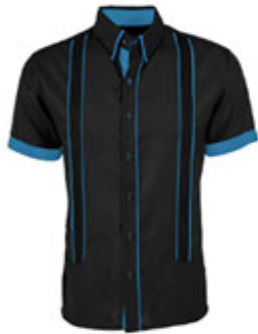
Couture Black Delicado Norteña Guayabera TWO POCKET STYLE