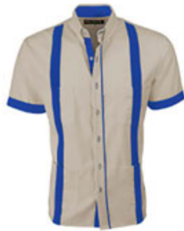
Couture Beige Acentuada Four Pocket Guayabera FOUR POCKET STYLE