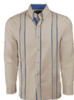
Couture Beige Delicado Presidencial Guayabera NO POCKET STYLE