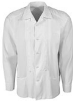
Yucateco Blanco Norteña Guayabera YUCATECO COLLECTION