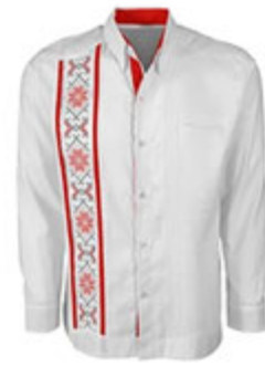
Yucateco Blanco y Rojo Guayabera YUCATECO COLLECTION