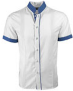
Couture Blanco Clásico Mau Presidencial Guayabera NO POCKET STYLE