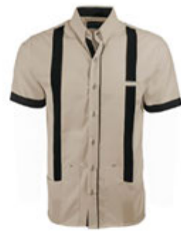
Couture Beige Acentuado Norteña Guayabera TWO POCKET STYLE