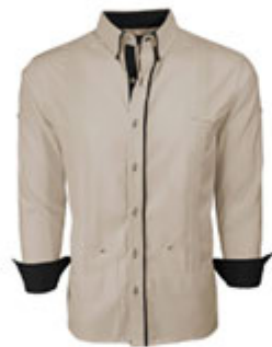
Couture Beige Clásico Norteña Guayabera TWO POCKET STYLE