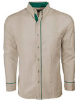
Couture Beige Clásico Presidencial Guayabera NO POCKET STYLE