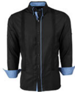
Couture Black Clásico Norteña Guayabera TWO POCKET STYLE