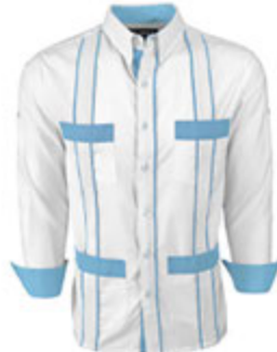
Couture Blanco Delicado Four Pocket Guayabera FOUR POCKET STYLE