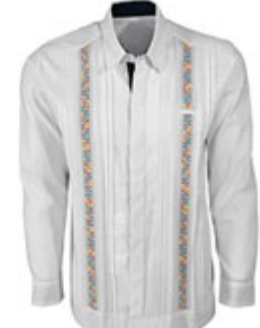
Yucateco Arcoiris Presidencial Guayabera YUCATECO COLLECTION