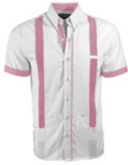
Couture Blanco Acentuado Norteña Guayabera TWO POCKET STYLE