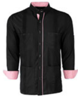
Couture Black Clásico Mandarin Four Pocket Guayabera FOUR POCKET STYLE