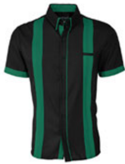
Couture Black Acentuada Presidencial Guayabera NO POCKET STYLE