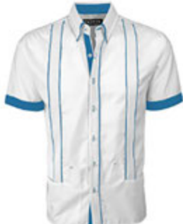
Couture Blanco Delicado Norteña Guayabera TWO POCKET STYLE