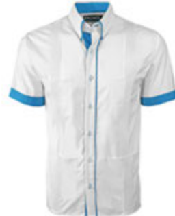
Couture Blanco Clásico Four Pocket Guayabera FOUR POCKET STYLE