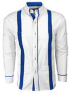
Couture Blanco Acentuada Four Pocket Guayabera FOUR POCKET STYLE