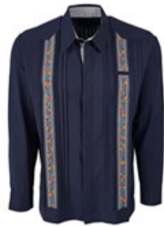
Yucateco Navy Arcoiris Presidencial Guayabera YUCATECO COLLECTION