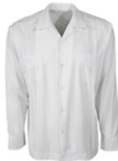
Yucateco Blanco Cubano Two Pocket Guayabera YUCATECO COLLECTION