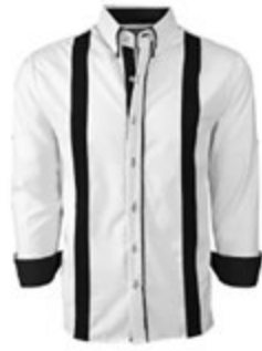
Couture Blanco Acentuado Presidencial Guayabera NO POCKET STYLE