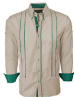
Couture Beige Delicado Norteña Guayabera TWO POCKET STYLE