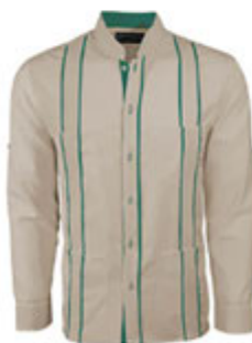
Couture Beige Delicado Mau Four Pocket Guayabera FOUR POCKET STYLE