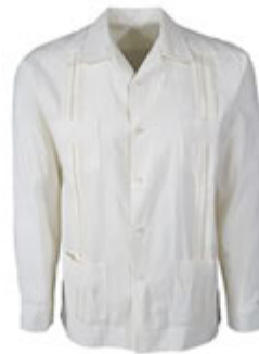
Yucateco Ivory Clasico Cubano Guayabera YUCATECO COLLECTION