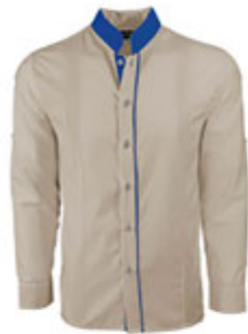
Couture Beige Clásico Mau Presidencial Guayabera NO POCKET STYLE