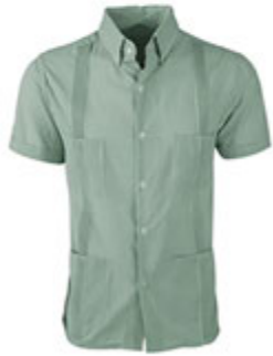
Guingán Clásico Green Guayabera