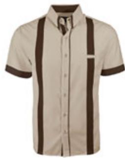
Couture Beige Acentuada Presidencial Guayabera NO POCKET STYLE