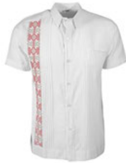
Yucateco Azteca Blanca Presidencial Guayabera YUCATECO COLLECTION