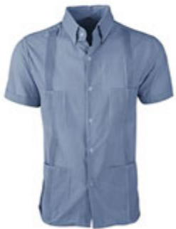
Guingán Clásico Navy Blue Guayabera