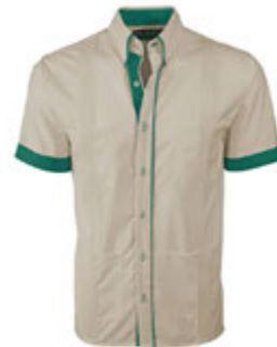
Couture Beige Clásico Four Pocket Guayabera FOUR POCKET STYLE