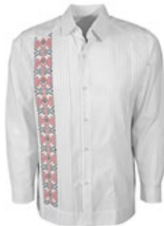
Yucateco Elegante Azteca Blanca Guayabera YUCATECO COLLECTION