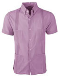
Guingán Clásico Rose Pink Guayabera