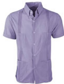
Guingán Clásico Lavender Guayabera