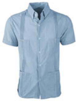
Guingán Clásico Sky Blue Guayabera