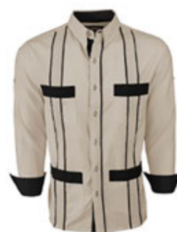
Couture Beige Delicado Four Pocket Guayabera FOUR POCKET STYLE