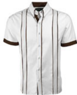
Couture Blanco Delicado Presidencial Guayabera NO POCKET STYLE