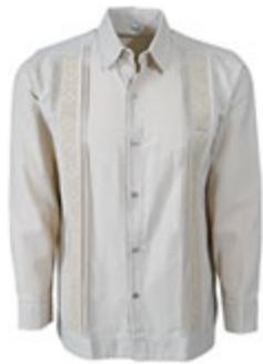
Yucateco Beige Presidencial Guayabera YUCATECO COLLECTION