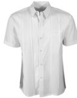
Yucateco Blanco Presidencial Guayabera YUCATECO COLLECTION