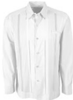
Yucateco Blanco Royal Presidencial Guayabera YUCATECO COLLECTION