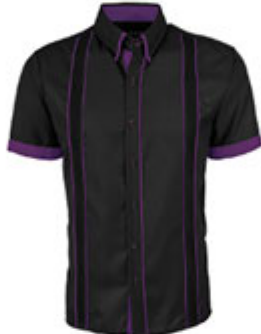
Couture Black Delicado Presidencial Guayabera TWO POCKET STYLE