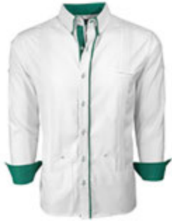
Couture Blanco Clásico Norteña Guayabera TWO POCKET STYLE