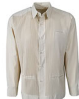
Yucateco Maize Presidencial Galore Guayabera YUCATECO COLLECTION