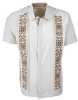
Yucateco Beige y Marrón Artesano Guayabera YUCATECO COLLECTION