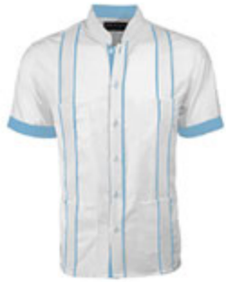
Couture Blanco Delicado Mau Four Pocket Guayabera FOUR POCKET STYLE