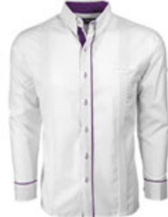
Couture Blanco Clásico Presidencial Guayabera NO POCKET STYLE