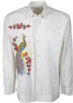
Yucateco Mayan Kutz Presidencial Guayabera YUCATECO COLLECTION