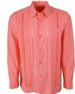
Yucateco Sunglo Royal Presidencial Guayabera YUCATECO COLLECTION