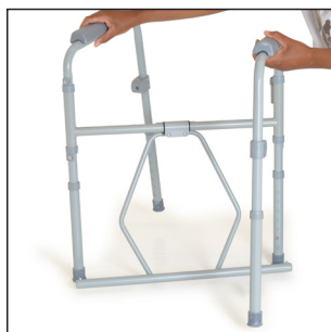
Unfold the commode frame