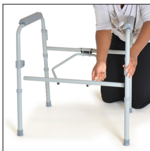
Insert the front cross bar into the front brackets (located on the front legs of the commode frame). Ensure both metal pins "CLICK" completely into holes