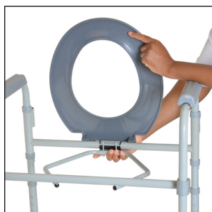
"Snap" on the toilet seat and cover to the back support bar