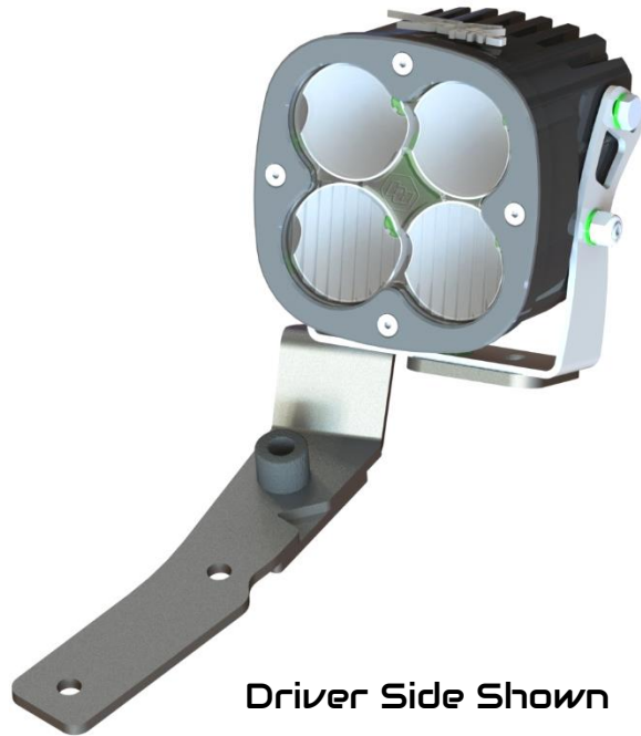
Driver Side Shown

***READ ALL INSTRUCTIONS THOROUGHLY FROM START TO FINISH BEFORE BEGINNING INSTALLATION!***