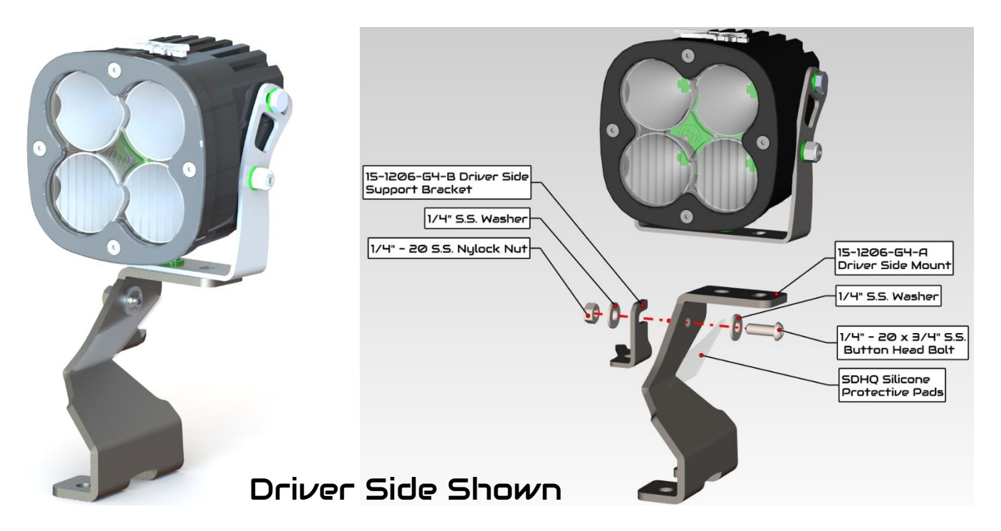
***READ ALL INSTRUCTIONS THOROUGHLY FROM START TO FINISH BEFORE BEGINNING INSTALLATION! ***