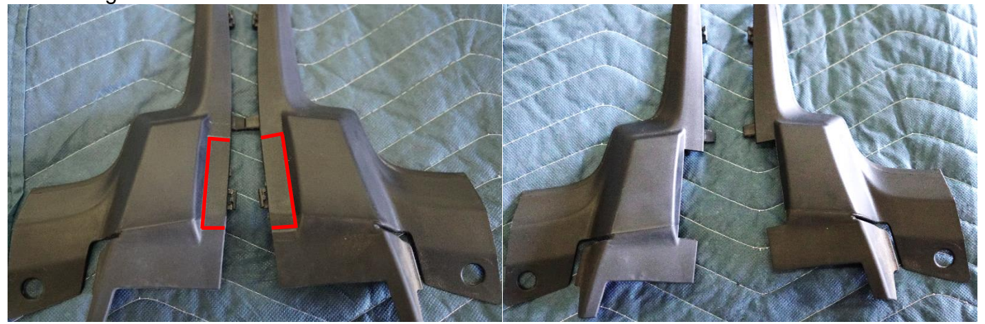
11. Install the cut cowls and press-in clips. Install lights using the hole, secure bigger lights with the slot if applicable. Position lights as desired. Enjoy your new SDHQ A-Pillar Light Mounts!

10. Now the cowls need to be cut. Measure and mark 7/16" from the center tab on the cowls. Measure and mark 2 ½" down from the first mark. Extend the marks to the raised edge. Cut along these lines as shown below.