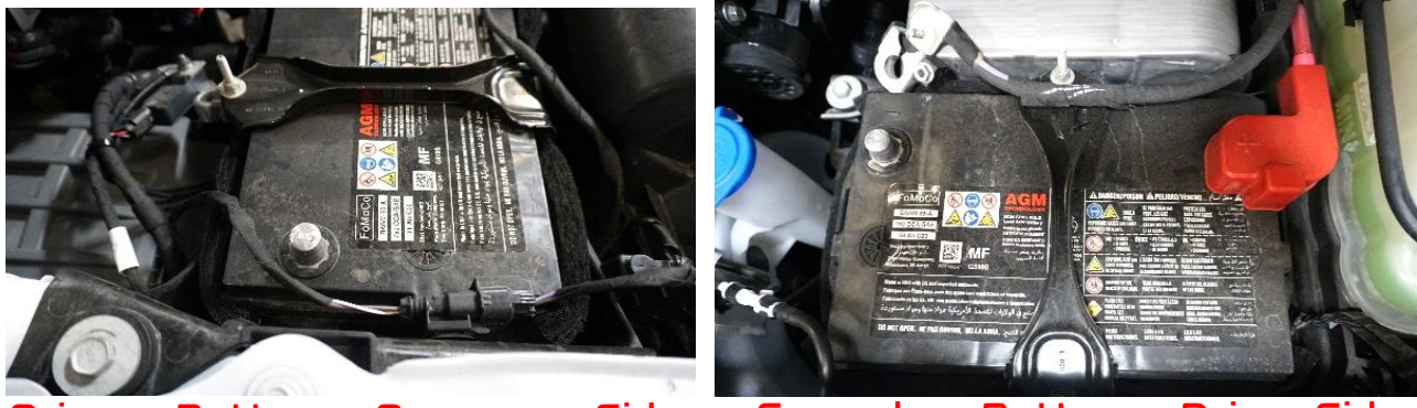
Primary Battery - Passenger Side