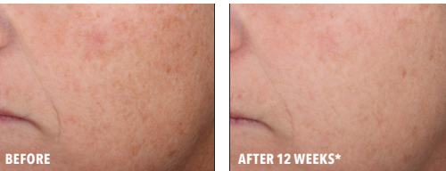
*DATA ON FILE (INTELLISHADE® ORIGINAL). RESULTS MAY VARY.

91% of subjects showed an improvement in the appearance of fine lines*