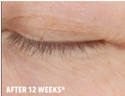
*DATA ON FILE. RESULTS MAY VARY.

Palmitoyl Tripeptide-38 and Palmitoyl Hexapeptide-14. Visibly improves the look of skin firmness, fine lines and wrinkles.