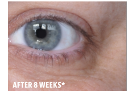
AFTER 8 WEEKS*