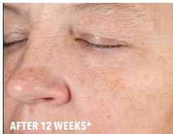
*DATA ON FILE. RESULTS MAY VARY.