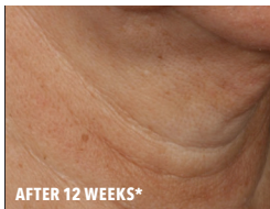
*DATA ON FILE. RESULTS MAY VARY.