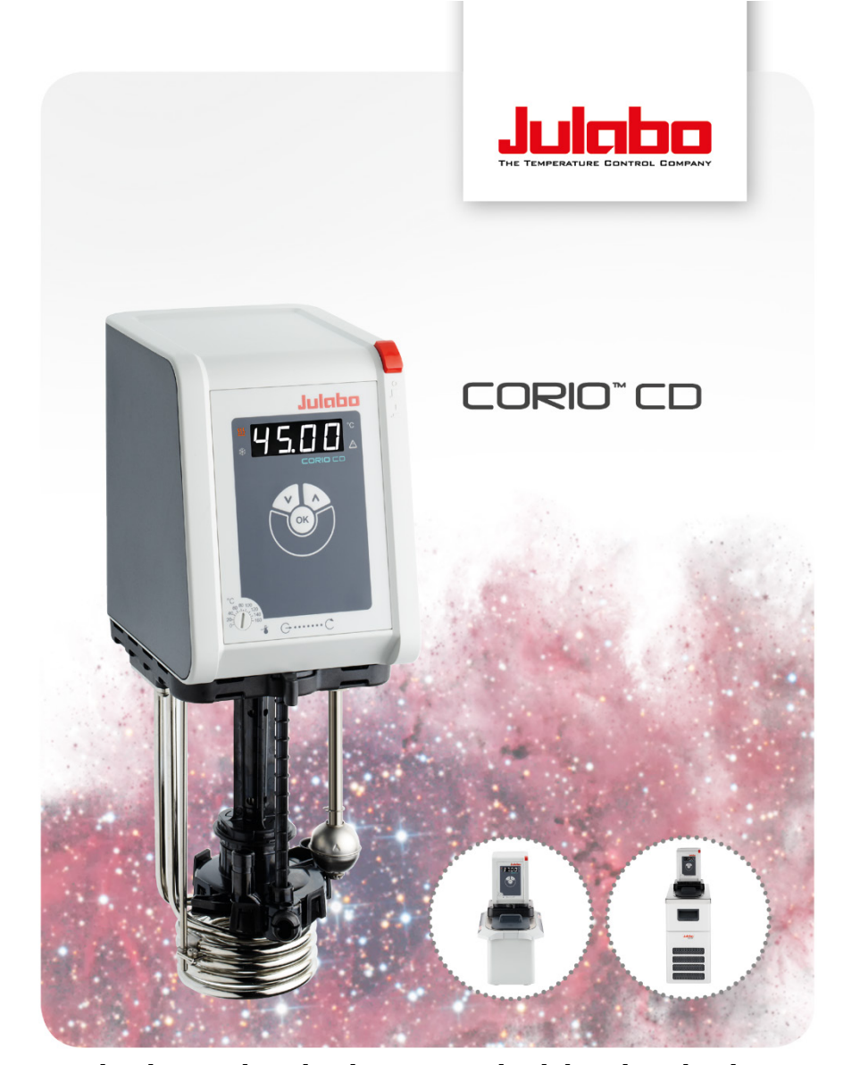
Heating immersion circulator, open bath heating circulator, refrigerated circulator