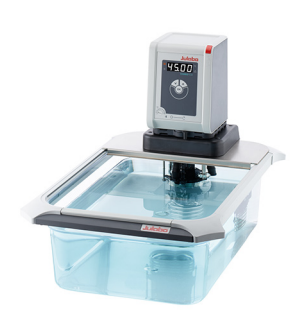
CORIO CD circulator for bath tanks up to 50 l.