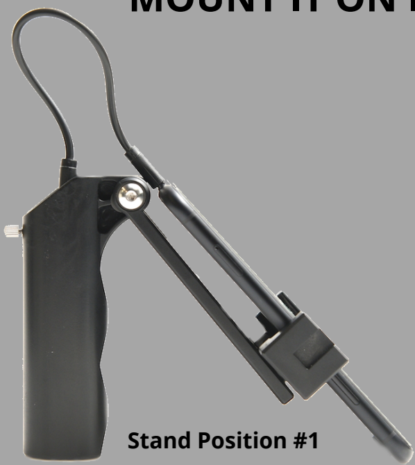
Stand Position #1

TO WATCH MOVIES OR VIDEO CHAT WITH YOUR FRIENDS: SET TUBI IN 1 OF 2 STAND POSITIONS OR MOUNT IT ON ITS STAND