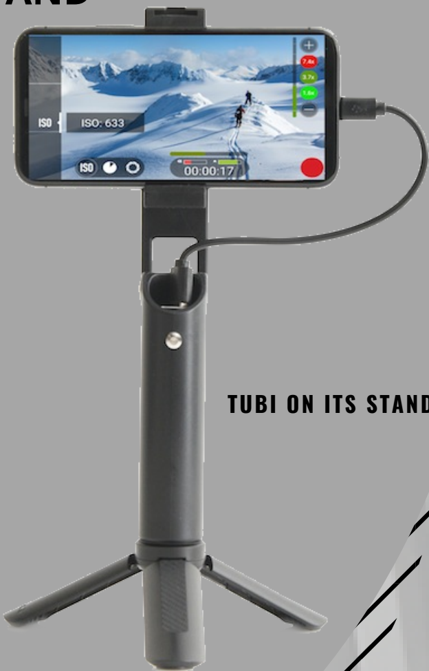
TUBI ON ITS STAND