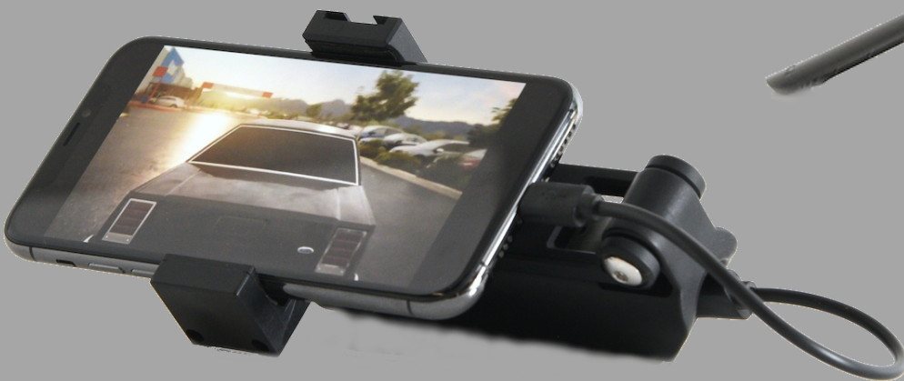
STAND POSITION #2