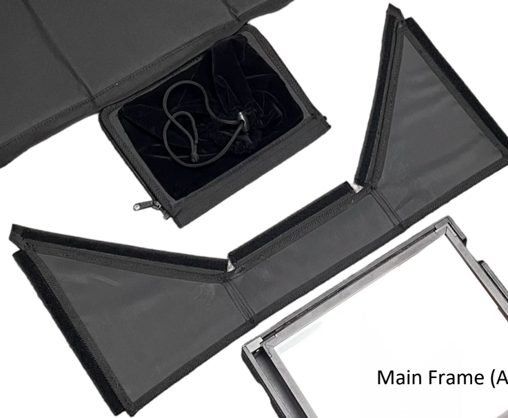
Main Frame (A)