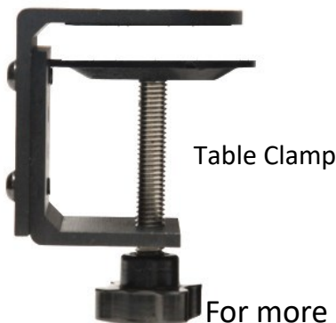
Table Clamp configuration: