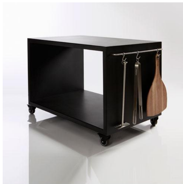
Table Weight: 71kgs, Size (WxDxH): 120x60x77 cm, Material: Black Powder coated steel and stainless steel handles.

The large space under the table is ideal for storing firewood, fresh ingredients, herbs, and whatever else a real pizza baker might need to have at his fingertips. The Outdoor Table can be easily manoeuvred using the stainless steel handles and robust rubber wheels. With three convenient hooks perfect for hanging your utensils and pizza oven tools.