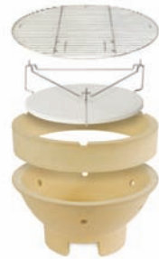
Roasting “Bottom” configuration.