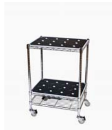
Small Recharging Trolley 24 Lamps