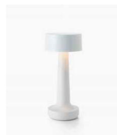
Baked Enamel Gloss Ivory White