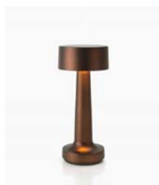
Anodised Satin Bronze