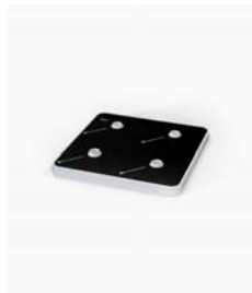
Small Recharging Tray 4 Lamps