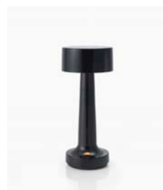
Anodised Satin Black