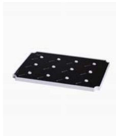
Large Recharging Tray 12 Lamps