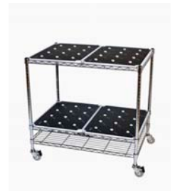
Large Recharging Trolley 48 Lamps