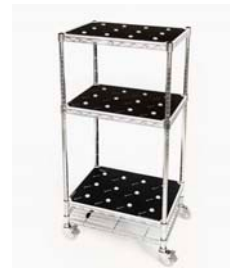
Medium Recharging Trolley 36 Lamps