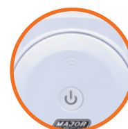
Manual On/Of Button