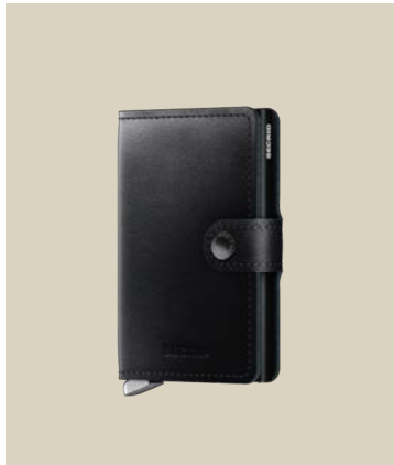
Miniwallet DUSK BLACK