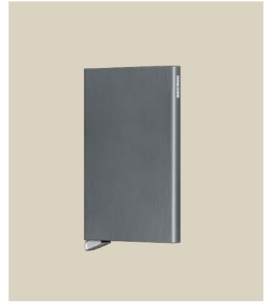
Cardprotector FROST TITANIUM