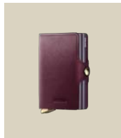
Twinwallet DUSK BORDEAUX