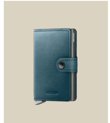
Miniwallet DUSK TEAL