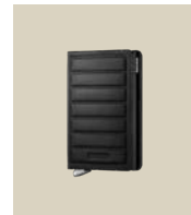
Slimwallet EMBOSS LINES