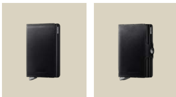
Slimwallet DUSK BLACK