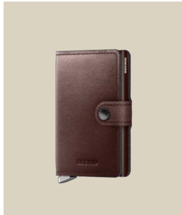
Miniwallet DUSK DARK BROWN