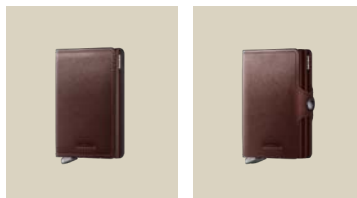
Slimwallet DUSK DARK BROWN