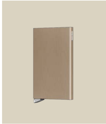
Cardprotector FROST SAND