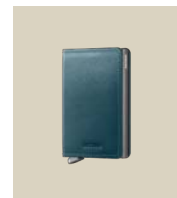
Slimwallet DUSK TEAL