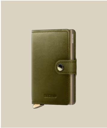
Miniwallet DUSK OLIVE