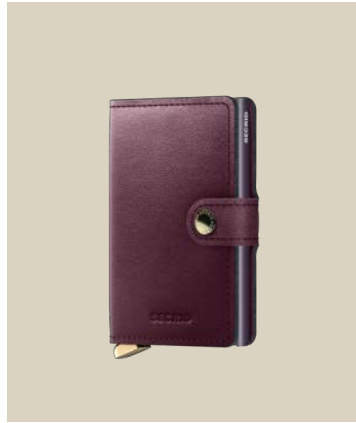
Miniwallet DUSK BORDEAUX