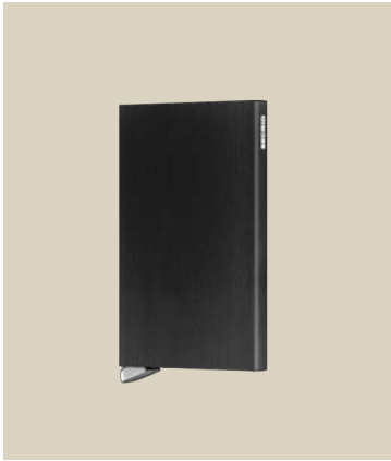
Cardprotector FROST BLACK