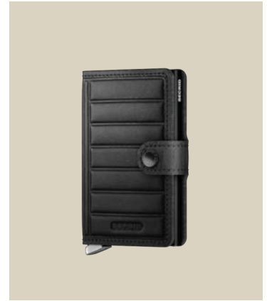
Miniwallet EMBOSS LINES