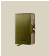
Twinwallet DUSK OLIVE