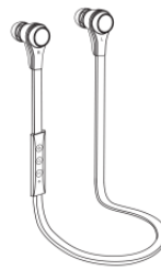
SH802 Bluetooth® Headset User manual