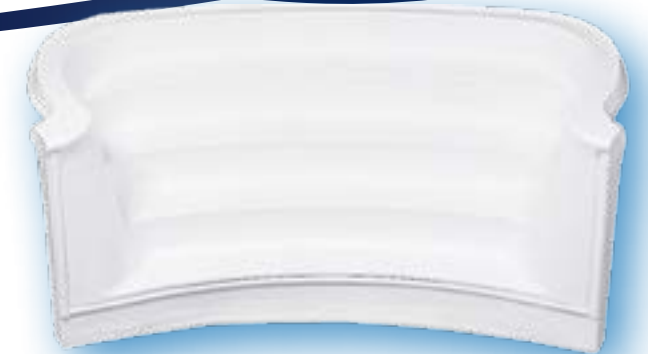
8 Foot French Curved Step