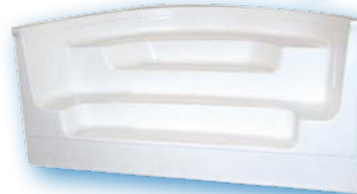
11 Foot Straight Roman Step