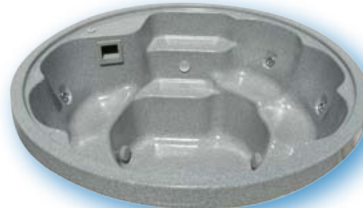
92 Inch Scalloped Stand Alone Spa Plumbed, Foamed and Jetted