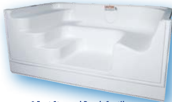
8 Foot Step and Bench Cantilever Plumbed and Jetted