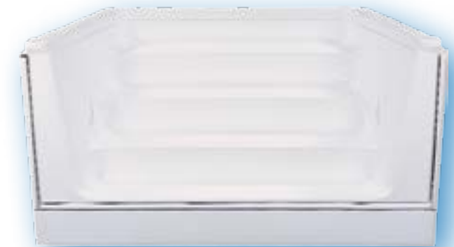
8 Foot Straight Step Available for 42 Inch & 48 Inch pool wall