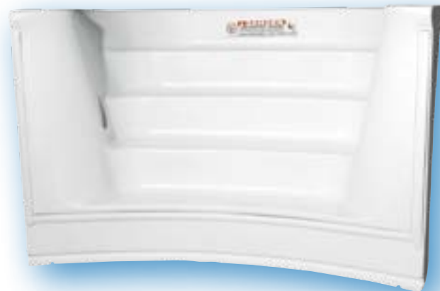
6 Foot French Curved Step Available for 42 Inch & 48 Inch pool wall.