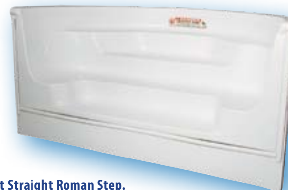
8 Foot Straight Roman Step.