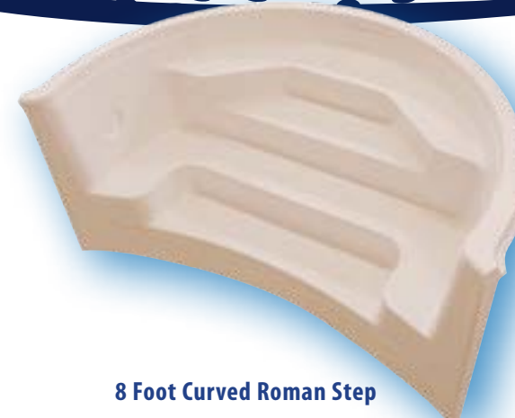
8 Foot Curved Roman Step