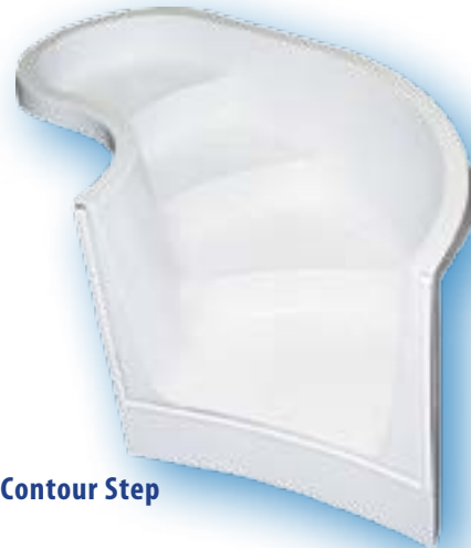
4 Foot Contour Step