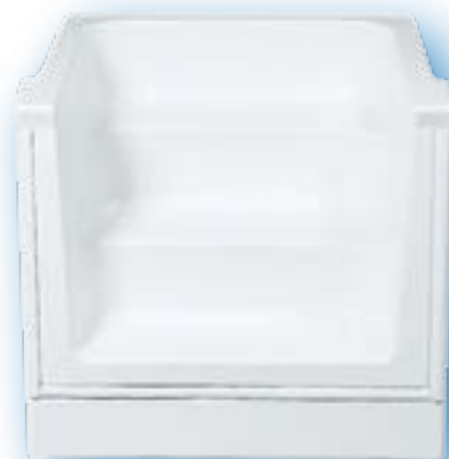
4 Foot Straight Step