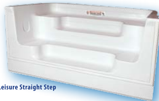
8 Foot Leisure Straight Step