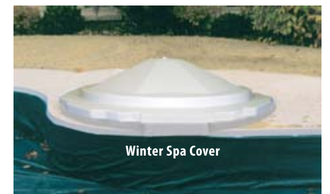
Winter Spa Cover