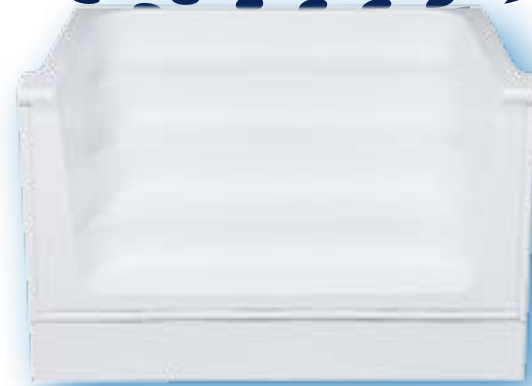
6 Foot Straight Step Available for 42 Inch & 48 Inch pool wall.

Most coloured steps are only available in Cantilever models. All models are not available in every colour. Refer to chart on page 6 for options.