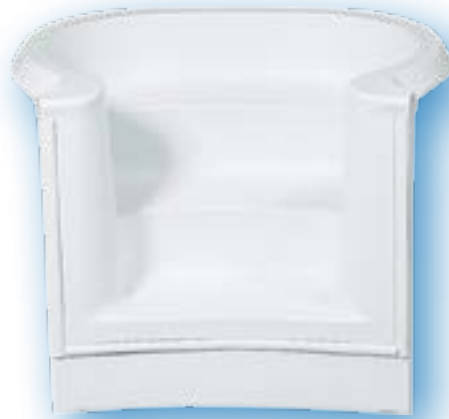
4 Foot French Curved Step