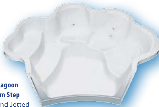
5 Foot Lagoon Free Form Step Plumbed and Jetted