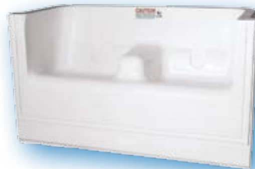
6 Foot Double Seat Cantilever Plumbed and Jetted