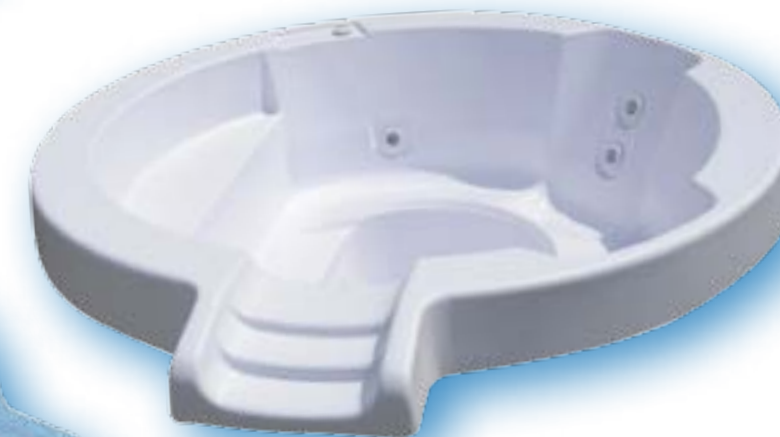
90 Inch Round Spill Over Spa Plumbed, Foamed and Jetted