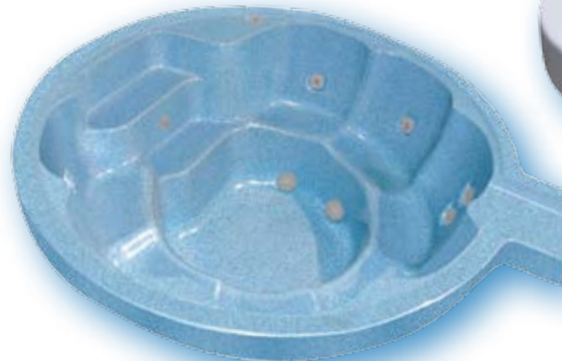
92 Inch Scalloped Spill Over Spa Plumbed, Foamed and Jetted