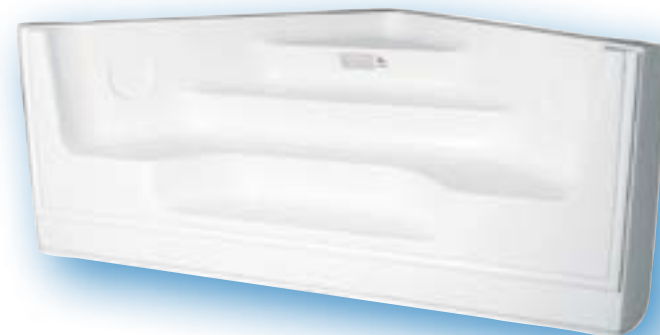
90 Degree Corner Step Cantilever