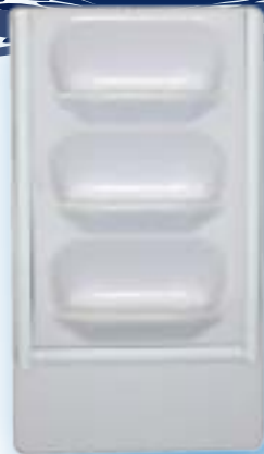
2 Foot In-Wall Ladder