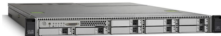
Figure 1. Cisco UCS C220 M3 Server

The Cisco UCS C220 M3 interfaces with Cisco UCS using another unique Cisco innovation: the Cisco UCS Virtual Interface Card. The Cisco UCS Virtual Interface Card is a virtualization-optimized Fibre Channel over Ethernet (FCoE) PCI Express (PCIe) 2.0 x8 10-Gbps adapter designed for use with Cisco UCS C-Series servers. The VIC is a dual-port 10 Gigabit Ethernet PCIe adapter that can support up to 256 PCIe standards-compliant virtual interfaces, which can be dynamically configured so that both their interface type (network interface card [NIC] or host bus adapter [HBA]) and identity (MAC address and worldwide name [WWN]) are established using just-in-time provisioning. In addition, the Cisco UCS VIC 1225 can support network interface virtualization and Cisco ® Data Center Virtual Machine Fabric Extender (VM-FEX) technology.