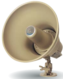
SPT15A, SP158A, SPT30A+, SP308A+