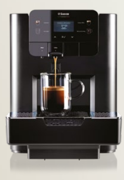
AREA Focus Nespresso®*

Optional water supply connection (with the water supply kit)