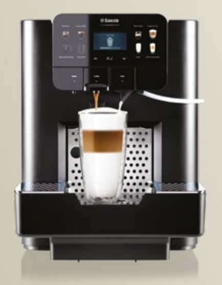
AREA OTC HSC Nespresso®*

Optional water supply connection (with the water supply kit)