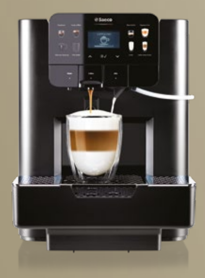
AREA OTC HSC Lavazza Blue®*