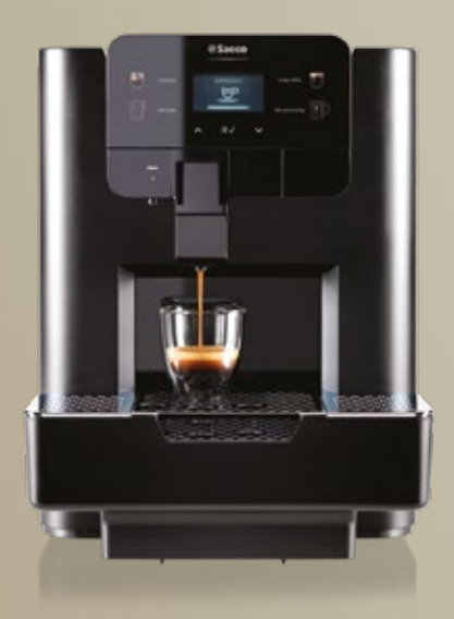
AREA Focus Lavazza Blue®*

Optional water supply connection (with the water supply kit)