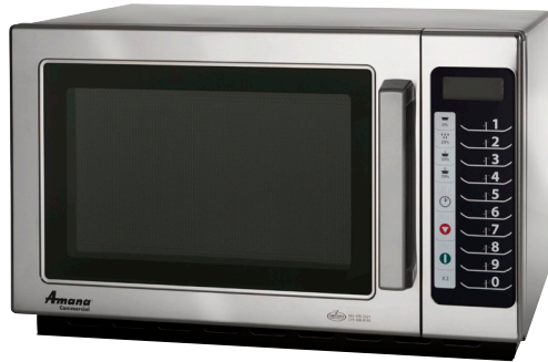
Model RCS10TS shown