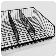
Wire Baskets with Dividers