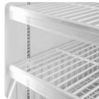
Hinged Menu / Price Strip

*Regular condenser cleaning and maintenance not required under normal operating conditions. Some exceptions may apply. Contact Minus Forty for more information.