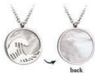
Ocean and Earth Solid XN1918S19-MPW