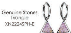
Genuine Stones Triangle XN2224SPH-E

IFJAG ORLANDO February 5 - February 8 , 2024 Embassy Suites Room # 421