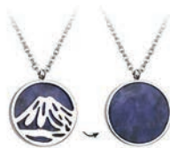
Mountain & Earth Solid XN1917S19-BSE