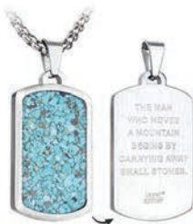
Move Mountains XN1930S04-GTU