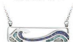
Ocean and Earth Rectangle XN1908S0-WAV1