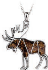
Wildlife and Earth BN1918I1-MO2