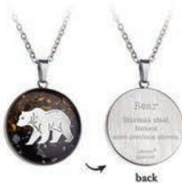
Wildlife and Earth Round XN1931S0-BE6