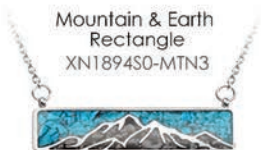
Mountain & Earth Rectangle XN1894S0-MTN3