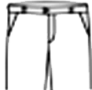
With Belt Loops