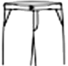
No Belt Loops