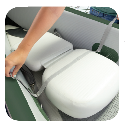
Pull through and loop through d-ring on opposite side. Tighten strap to secure seat.