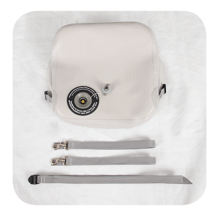
Inflatable Seats Include 2 side straps and one bottom strap to secure the seat in place.

Clip strap to the angled d-ring on the side of the canoe. Tighten strap as needed. Repeat on other side.