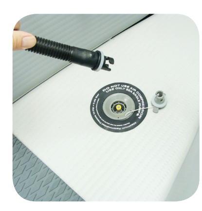
Insert the hooked adapter into the valve and turn to the right until fully seated.

Insert the adapter into the valve. Make sure the valve stem is in the UP/CLOSED position before inflation.