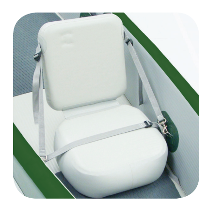
Inflate seats to 3 psi or until comfortable. Set into place.

Loop the long bottom strap through the horizontal d-ring.