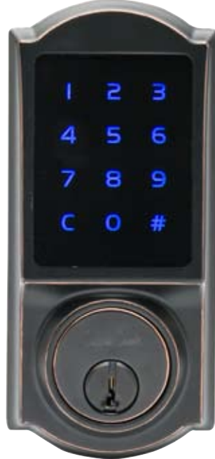
DBZH Single Cylinder Deadbolt