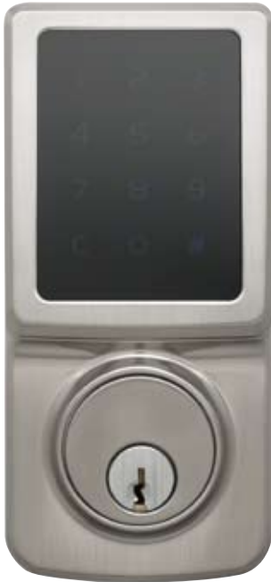
DBZF Single Cylinder Deadbolt