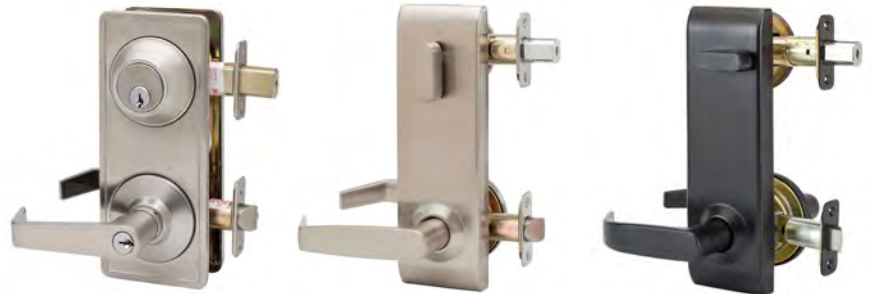
AL6941 4" Center to Center Grade 2