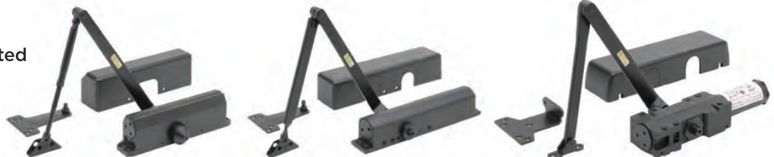
CL8400 Standard Duty Grade 1