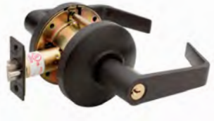
7200 Series - Extreme Duty ANSI/BHMA Grade 1