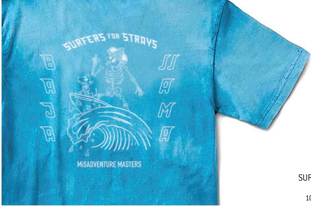
SURFERS FOR STRAYS - TIE DYE Wholesale $18 / MSRP $36 100% Long Staple Peruvian Cotton