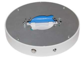
EM Battery Backup / KYS-07D20 (available separately)