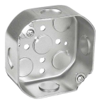
4" Junction Box