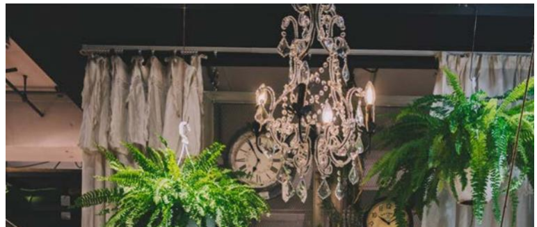
Decorative – Chandeliers, Hanging Fixtures