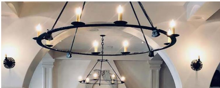
Wall Mounts – Sconces, Vanities