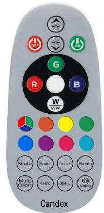
AAA batteries required (not included)