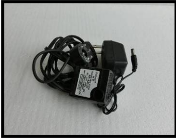
A. Pump with LED Light (model may vary)

Carefully identify and count all components as shown below. Photos may slightly vary from what you receive.