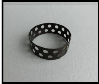
B. Top Ring