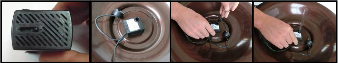
Fig 2. A - 2.B