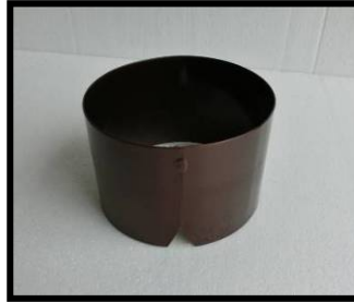
C. Bottom Ring