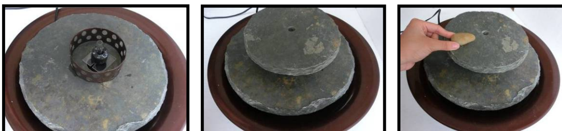
Fig 7. A - 7.B