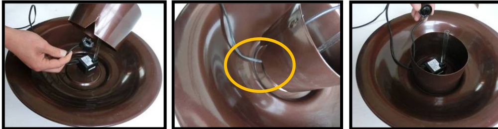
Fig 4. A - 4.C