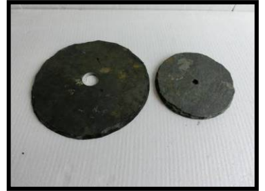
D. Slates (one big & one small)