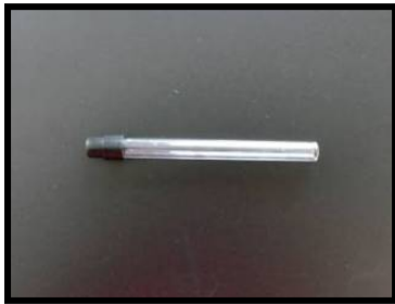
E. Acrylic Pipe