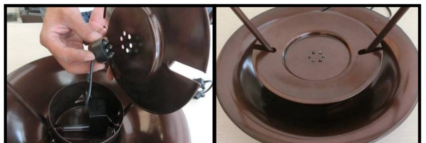
Fig. 8. A & B