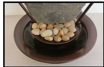
Fig. 11. A

Step 11 Lay the Rocks (I) onto the Rock Dish (E). Place smaller rocks around the larger rocks and under the slate as shown in Fig 11. A. Fill the fountain bowl with water until it is 1/4" below the Rock Dish (E). Distilled or purified water is recommended.