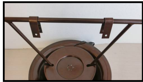
Fig. 9. A

Step 9 Unscrew the Female and Male Screws (F) and lay them next to the fountain so you can reach them. Hang the Slate Straps (F) on the top of the Water Disperser Pipe (A) as shown in Fig. 9.A.