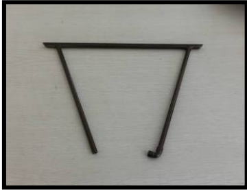
A. Water Dispenser Pipe

Carefully identify and count all components as shown below. Photos may vary slightly from what you receive.