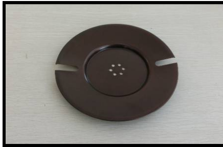
E. Rock Dish