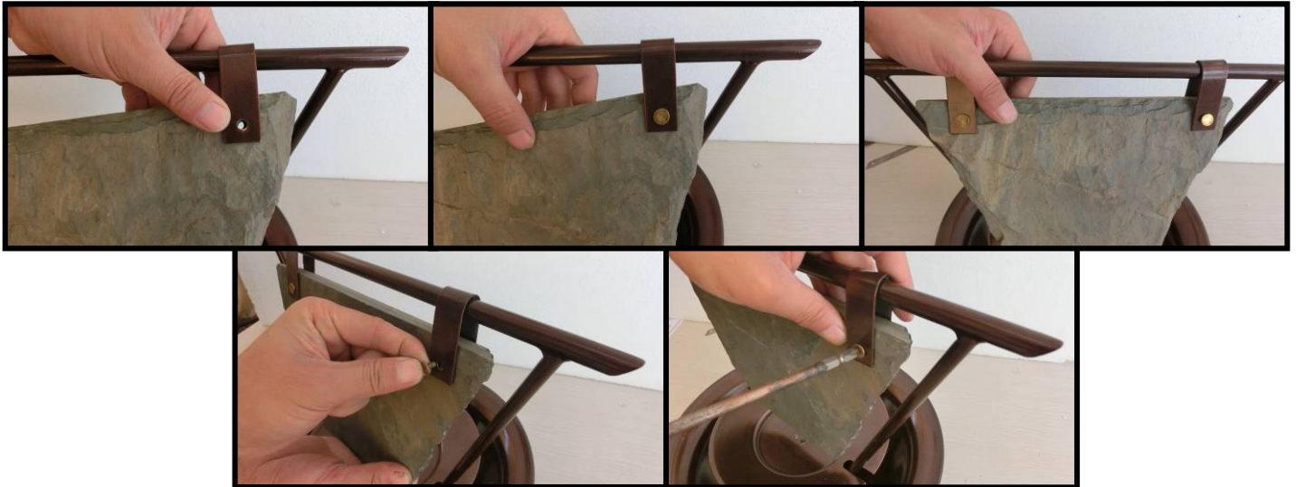
Fig. 10. A - E

Step 10 We recommend that two people work on this step. Attach the Slate (H) to the Slate Straps (F) by sliding the Slate (H) between the two sides of the Slate Straps (F). The chipped, angled edge should face the front of the fountain. Insert the Female Screw (F) with the hole on the end into the hole of the Slate Straps (F), next insert the Male Screw into the hole of the Female Screw on the back side of the Slate (H), repeat on the other side. Use a Phillips Screwdriver to tighten the Male Screws, Fig. 10. A- E.