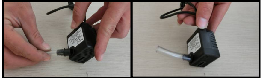
Fig. 5. A & B