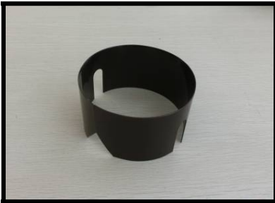
D. Support Ring