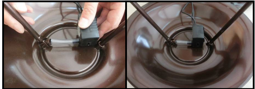
Fig. 6. A & B