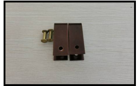
F. Slate Straps with Female and Male Screws (2 of each)