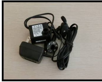
B. Pump with LED Light (model may vary)