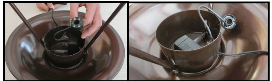
Fig. 7. A & B