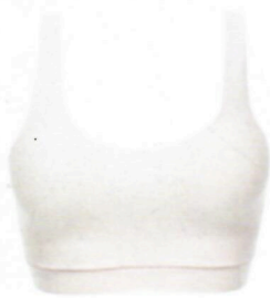
CHANTELLE SOFT STRETCH SET $71