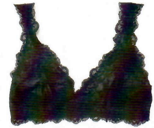
JANIRA GRETA BRALETTE SET $112