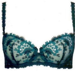
SIMONE PÉRÈLE WISH SET $227