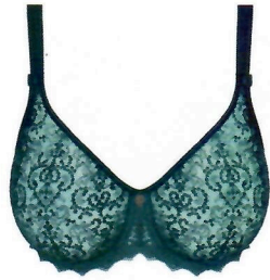
EMPREINTE CASSIOPÉE SET $307