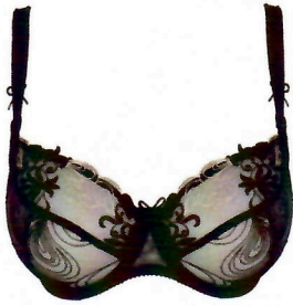
EMPREINTE TOSCA SET $284