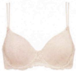
SIMONE PÉRÈLE PROMESSE SET $215