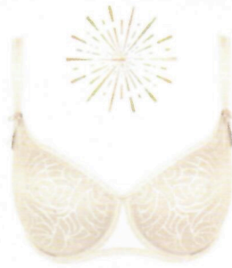
EMPREINTE VERITY SEAMLESS SET $253