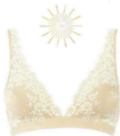
WACOAL EMBRACE LACE BRALETTE SET $81