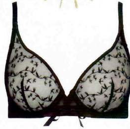
SIMONE PÉRÈLE 1948 SET $258