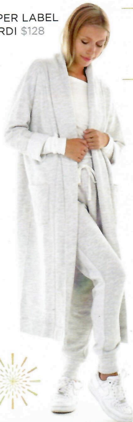
PAPER LABEL CARDI $128

SIMPLE, PURE AND CLEAN, THIS GIRL NEEDS LIGHTS AND BRIGHTS TO FEEL HER BEST.