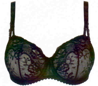
PRIMADONNA DELIGHT SET $233