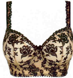
PRIMADONNA DOLCE VITA SET $263