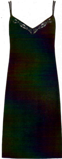
CYELL DRESS $115