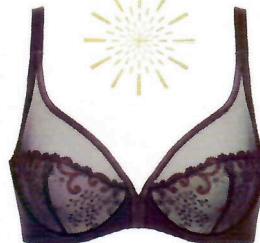
SIMONE PÉRÈLE DELICE SET $203