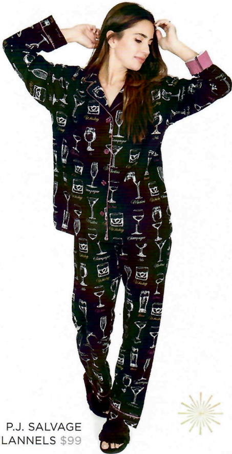
P.J. SALVAGE FLANNELS $99