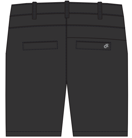
Sydney Short Pant [ MUS022 ]