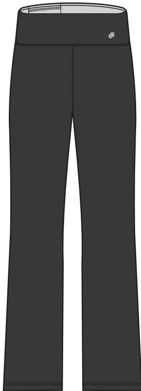
Surrey Active Pant [ WUS024 ]