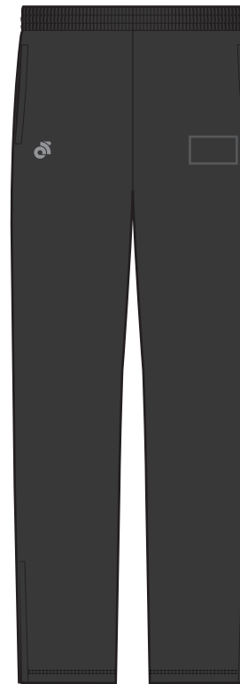
Madrid Long Pant [ MUS023 ]