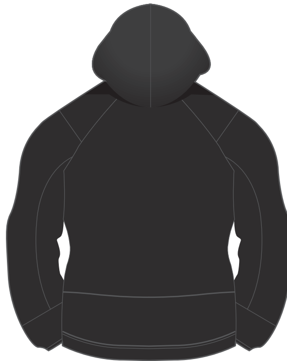
Canterbury Hoodie [ MUP045 ]