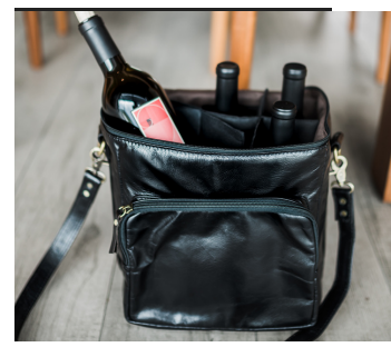
16 BOTTLE CARRIER