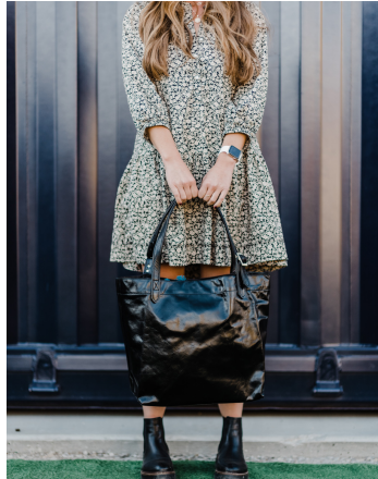
ARMERS MARKET TOTE