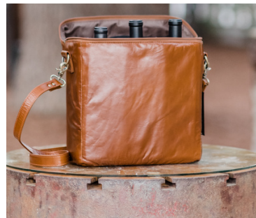
3 BOTTLE CARRIER