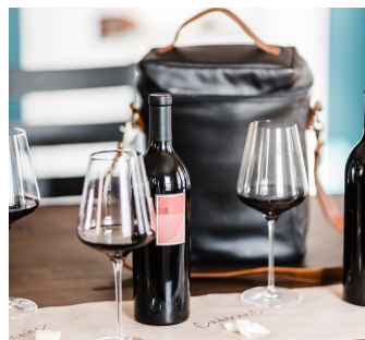
2 BOTTLE CARRIER