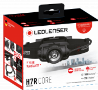
Example Packaging Illustration