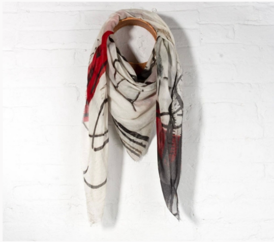
Wearable Art, Everyday Style