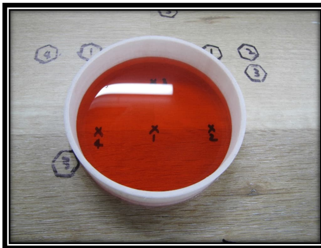
24 hrs With Water