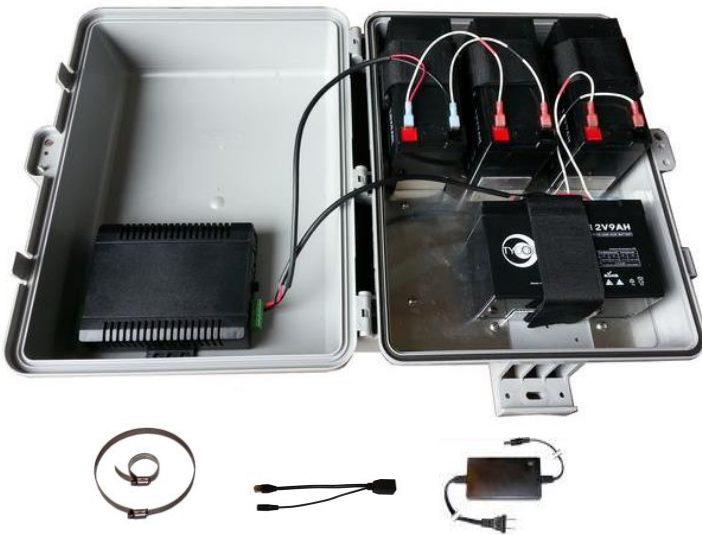
UPSPro® Polycarbonate Enclosure System