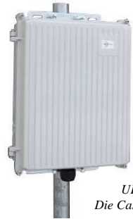
UPSPro ® Die Cast Enclosure