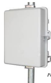
UPSPro ® Polycarbonate Enclosure