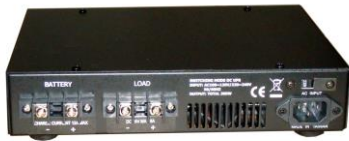
Smart 210W Charge Controller