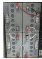
48V 51Ah Battery Configuration