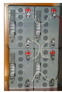
24V 102Ah Battery Configuration