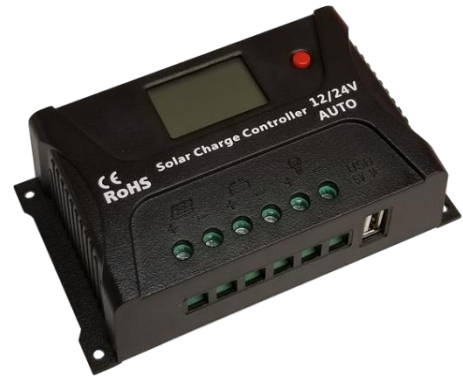
12V / 24V Intelligent Solar Charge Controller