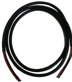
20' Outdoor Rated 12AWG Cable