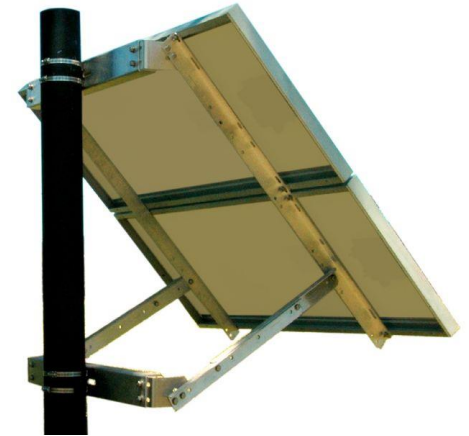
160W and 320W Kit Mount System