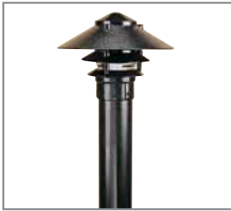
Model: SPJ12-07 Finish: Powder Coat Black