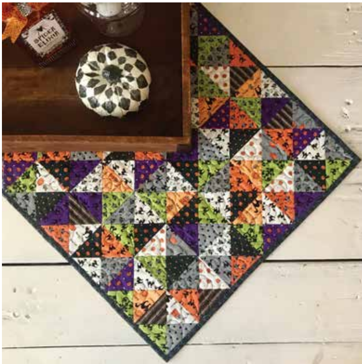
Table topper 21-1/2" square

Find the free tutorial in our Topsy Tuesday #13 episode.