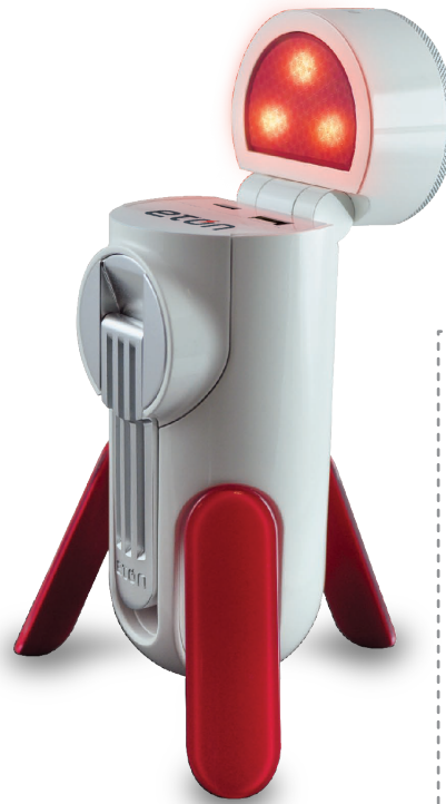
Micro-USB and standard USB-A connector