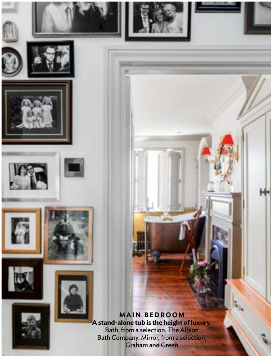
MAIN BEDROOM A stand-alone tub is the height of luxury. Bath, from a selection, The Albion Bath Company. Mirror, from a selection, Graham and Green

old bathroom into a spare room, giving it an exotic feel with patterned fabrics and wallpaper and a pretty gilded bamboo-effect chandelier. The main bedroom houses a copper-coloured freestanding bath and accessories in yellow, orange and gold.