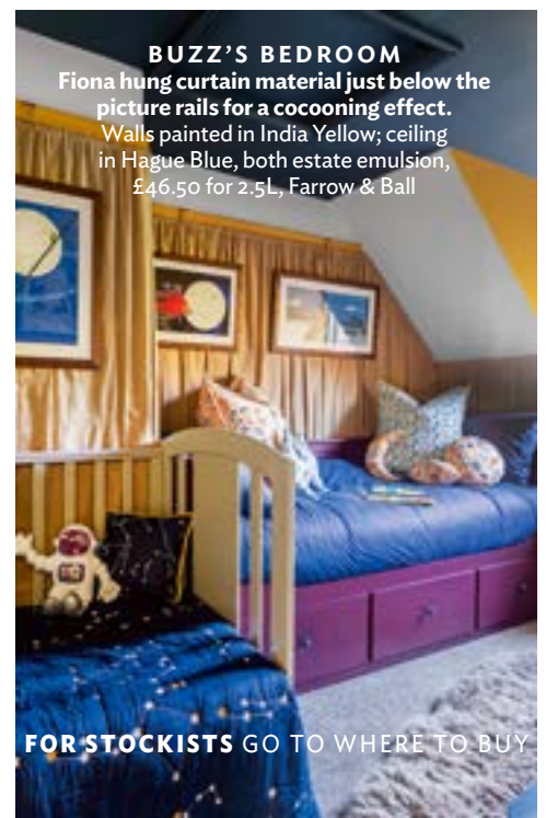
BUZZ'S BEDROOM Fiona hung curtain material just below the picture rails for a cocooning effect. Walls painted in India Yellow; ceiling in Hague Blue, both estate emulsion, £46.50 for 2.5L, Farrow & Ball