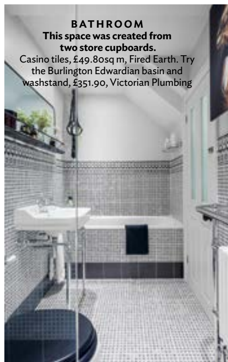
BATHROOM This space was created from two store cupboards. Casino tiles, £49.80sq m, Fired Earth. Try the Burlington Edwardian basin and washstand, £351.90, Victorian Plumbing