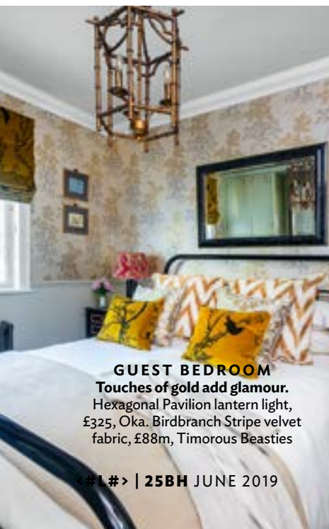
GUEST BEDROOM Touches of gold add glamour. Hexagonal Pavilion lantern light, £325, Oka. Birdbranch Stripe velvet fabric, £88m, Timorous Beasties

DECORATING TIP 'Pick three colours and use them throughout your home. So even though each room can be different, there is something tying them together'