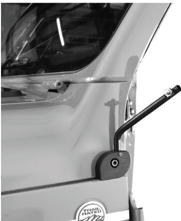
Fig 6 After the mirror block is firmly attached slide the stem into the upward facing hole. This drilled hole has tight tolerances to reduce any vibration, and will be a tight fit. It might require turning the stem back and forth.