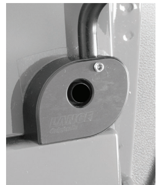
Fig 8 Shown with set screw

Select the set screw to hold the stem in place. There are two types: The knob set screw (J) is for ease with quick release. The small flush set screw (I) is more flush but requires an Allen key for removal (not provided).