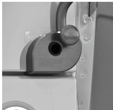
Fig 7 Shown with Knob