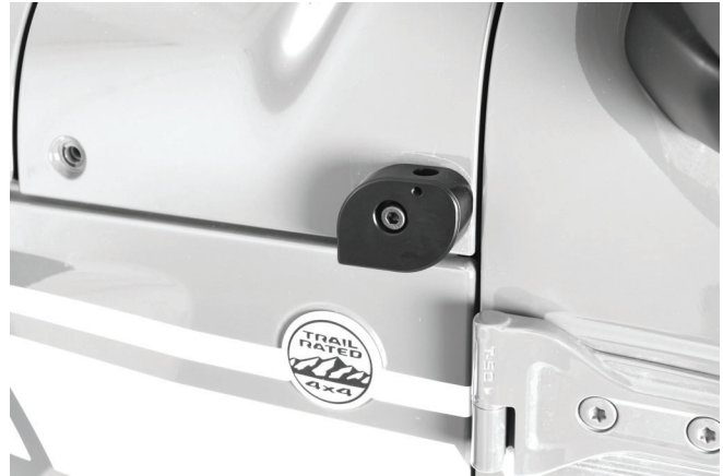
Fig 5 Replace the OEM torques head screw with the longer ones provided in your mirror kit and tighten until snug. DO NOT OVER-TIGHTEN. Over-tightening can damage your paint Replace OEM screws in the three remaining holes.