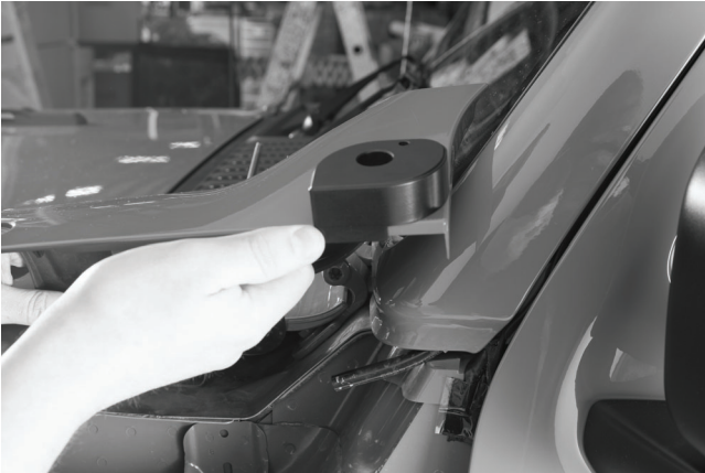
Fig 4 Slide the block on the body panel with the rounded side facing the door. And replace panel with the mirror block sleeved into the panel.