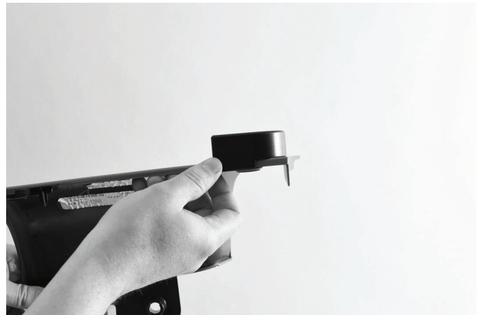
Fig 3 Test fit the mirror block (see fig 4 for placement) and apply 3M™ Laminant paint protection (k1) to the face of the Jeep body panel where the block will touch, and cut a hole for the bolt in the center with a sharp blade.