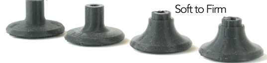
Soft to Firm